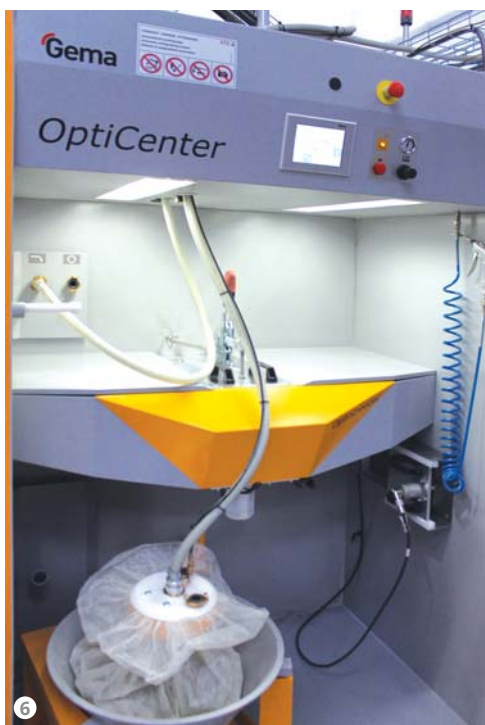
Figure 6: The new Gema OptiCenter.

therefore free of the pollutants present in the tank due to dragging, which ensures optimal product preparation before the nanotechnology passivation stage. This is carried out with Dollcoat SA 115, already used in the first plant. The Dollcoat SA product range is based on synthetic oligomers containing organically functionalised silanes, able to enhance the properties of the silanes themselves and ensuring excellent paint adhesion and corrosion protection. The nebulisation action ensures that a fresh product is always applied on parts for maximum treatment quality, avoiding any contamination due to dragging or to the presence of reaction by-products," states Minotti. "At the moment, we have opted for an acid phosphodegreasing stage because it ensures excellent results on both carbon and galvanised steel, the two most treated types of metal by TecnoLaser. However, the plant is ready to switch to an alkaline degreasing process in future."