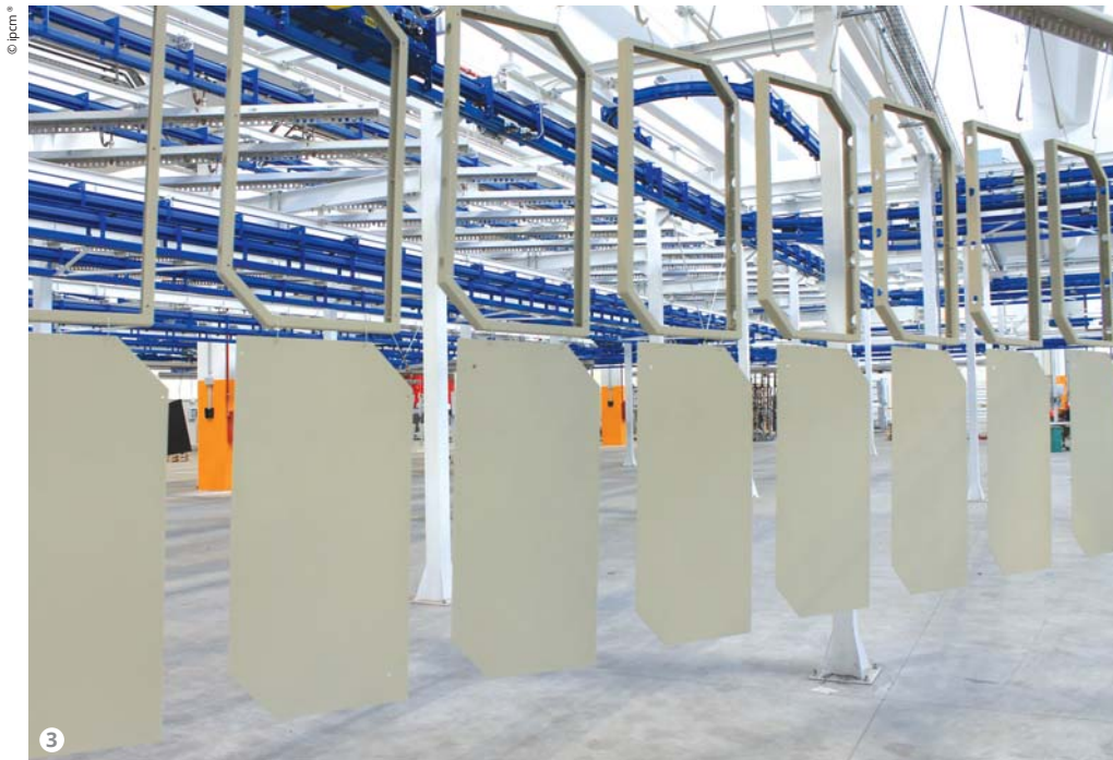
Figure 3: Tecnelaser treats parts in carbon steel, coil galvanised or electro galvanised steel, and structural steel.

no rinse pre-treatment process performed as follows: acid phosphodegreasing with products from the Dollphos range; 3 rinses with mains water; 1 semi-osmotic rinse; a pure flash of osmotic water; a nanotechnology passivation through nebulisation; and a hot air drying stage.