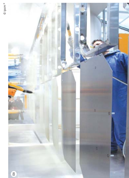
Figure 8: Both booths are equipped with pre and post-retouching stations.

“In order to design the new system, TecnoLaser set up a roundtable with Dollmar, as the sole supplier of pre-treatment products; Costabeber, as the plant engineering company; Gema Europe, for the installation of the new coating booth; and Futura Convogliatori Aerei, for the installation of the conveyor and of the 4.0 management software.”