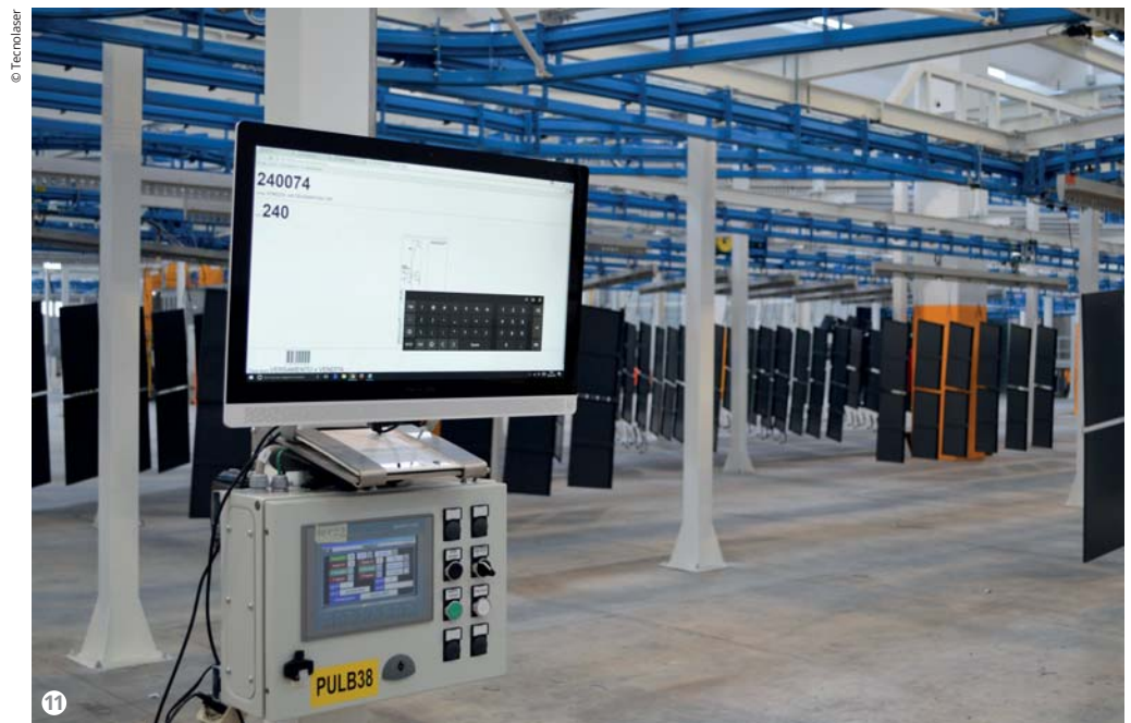
Figure 11: The new coating system is managed by integrated software 4.0.

states Tonin. “Our active collaboration with Dollmar, Futura, Costabeber, and Gema, as well as the technical suggestions received, have allowed us not only to improve the quality level of our production, but also to solve the handling and delivery problems that we encountered with the old plant layout. The new line offers us optimal flexibility thanks to the strategic positioning of storage buffers and the creation of priority routes for materials to be delivered urgently, made possible by the two-rail conveyor, but also thanks to the two spray paint booths that enabled us to perform a two-coat cycle and make improvements in terms of overspray and consumption. For the future, we are considering the integration of a third coating booth, working simultaneously to the two already in use, and the connection of the plant to another transport line that takes the workpieces directly to the subsequent assembly phases, thus achieving a complete and 4.0-oriented automation of production,” says Gian Maria Tonin. ○