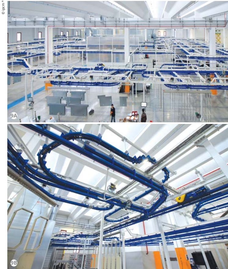
Figures 9A and 9B: Futura Convogliatori's two-rail conveyor.

positioned along the two-rail conveyor (in front of the pre-treatment tunnel, after the drying oven, and in the two unloading areas, as well as some 3-bar mini buffers at the booths' entrance and exit), plant downtimes have decreased and our production and delivery processes are no longer slowed down," states Filippo Tonello.