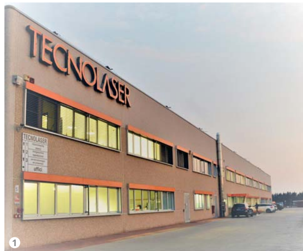
Figure 1: TecnoLaser’s plant in Curtarolo (PD, Italy).

“TecnoLaser, based in Curtarolo (PD, Italy) and specialising in the processing of sheet metal, was established in 1986 as a production department of Officine Facco & C. Spa, a manufacturer of plant engineering solutions for the poultry farming and breeding industry. The advent of automatic machines, which have facilitated some mechanical processes and reduced production times, then led TecnoLaser to expand its production capacity and acquire new customers. That is why it moved to a new larger site, suitable for hosting its new work cycles.”