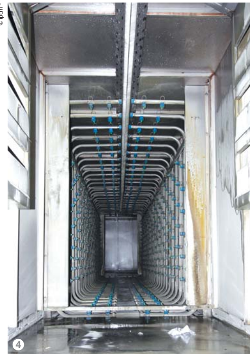
Figure 4: The pre-treatment tunnel

“Aware that one of the main process variables is the substrate quality of sheets, which cannot be controlled, we relied on Tecnelaser’s previous experience to solve the old plant’s critical issues and fully meet their needs. That is why we implemented technologies that could improve