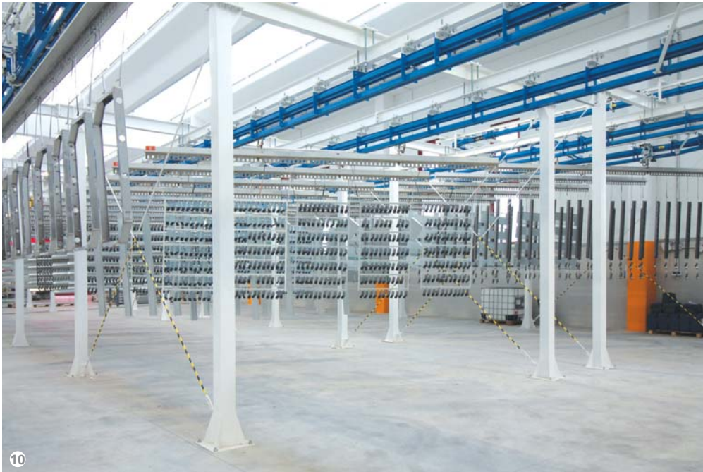
Figure 10: Futura Convogliatori's two-rail conveyor.

process and its integration with our internal system enables us to carry out activities such as updating production orders with no human intervention. Moreover, since the system and the software communicate with each other, we can trace the different colour batches and intervene promptly in case of any problems.”